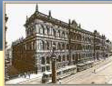
Academy of Sciences